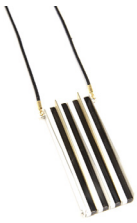
Carlos Cruz Diez