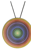
Julio Le Parc